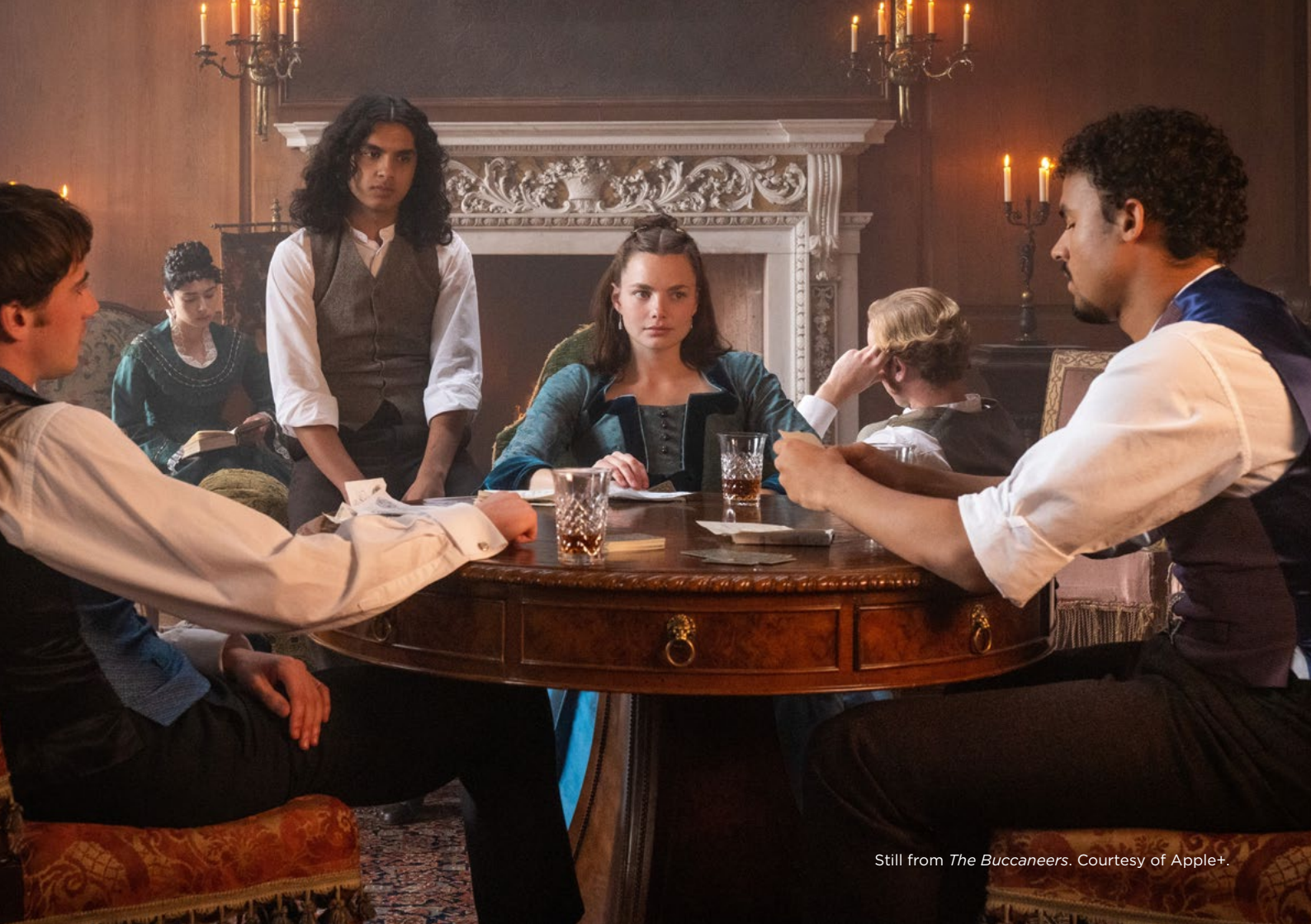
Still from The Buccaneers .