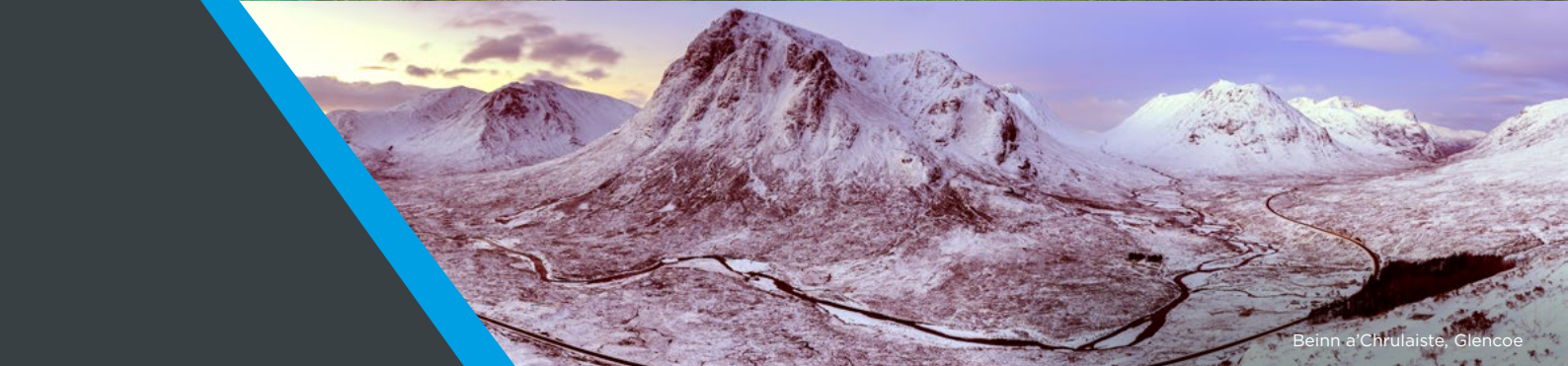
Beinn a'Chrulaiste, Glencoe