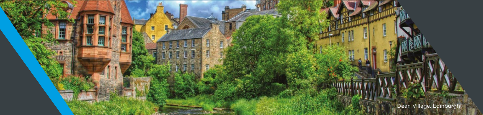
Dean Village, Edinburgh