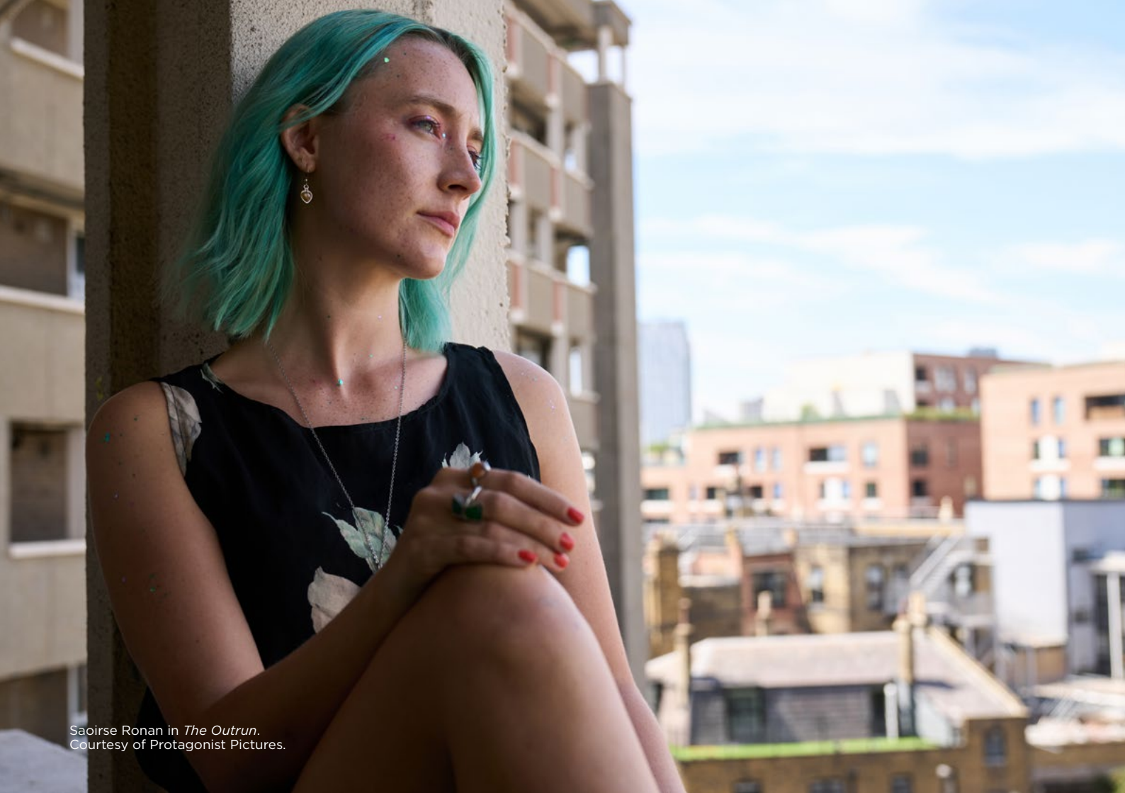
Saoirse Ronan in The Outrun .