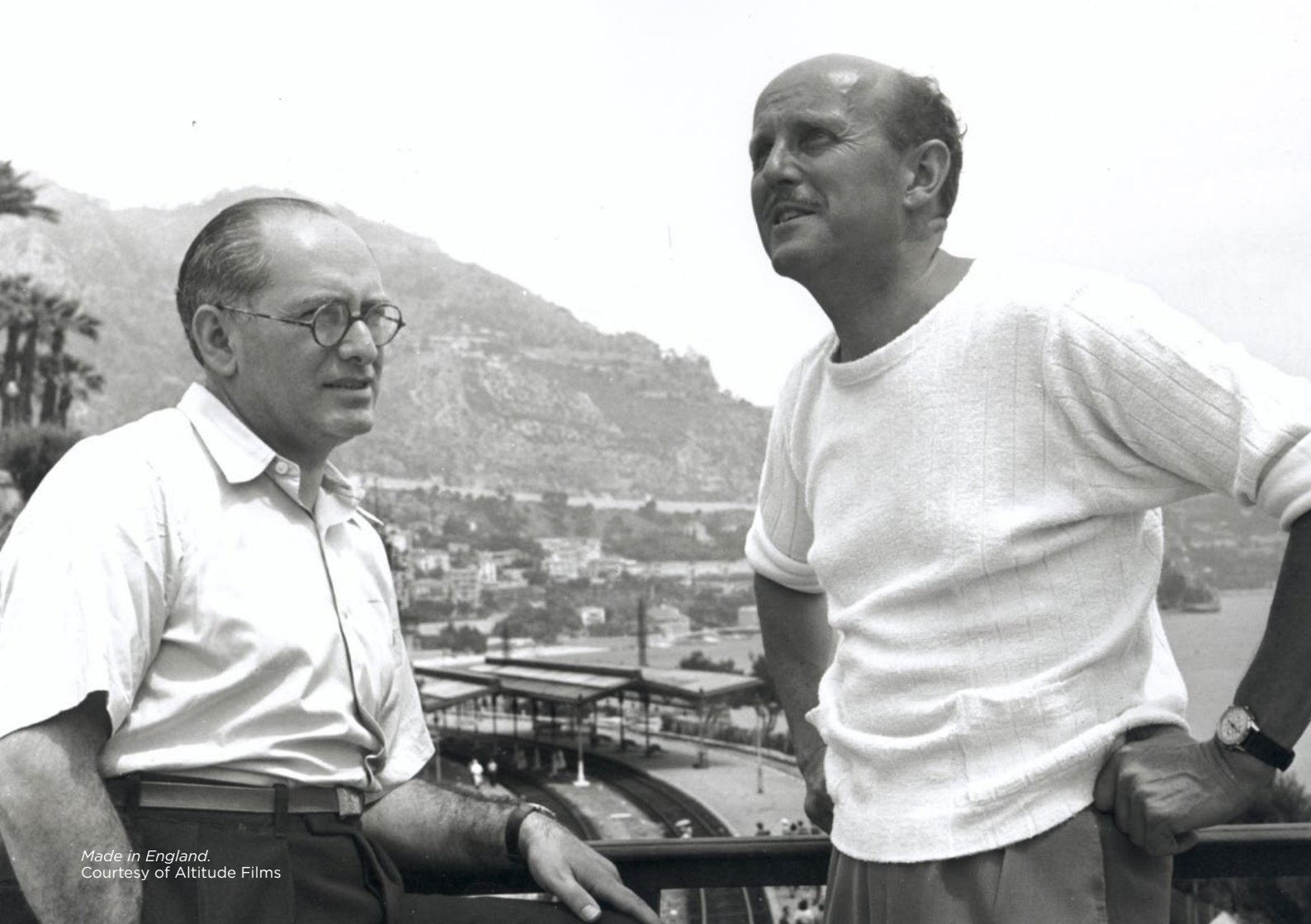
Made in England.