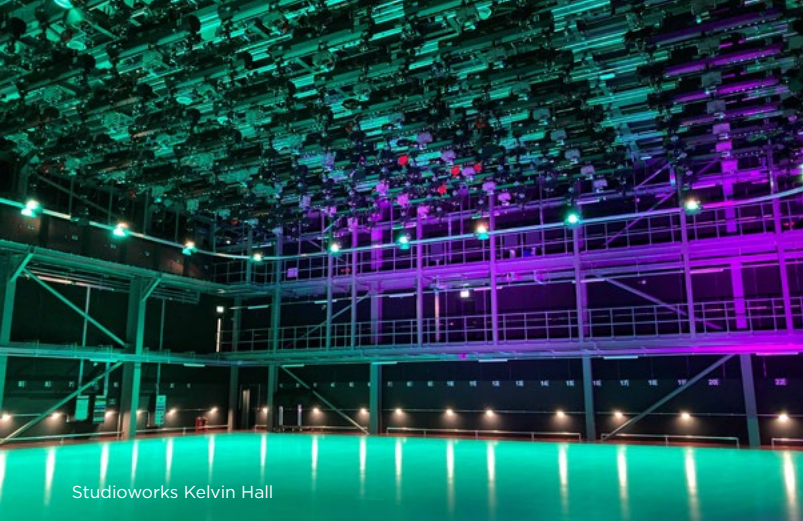
Studioworks Kelvin Hall