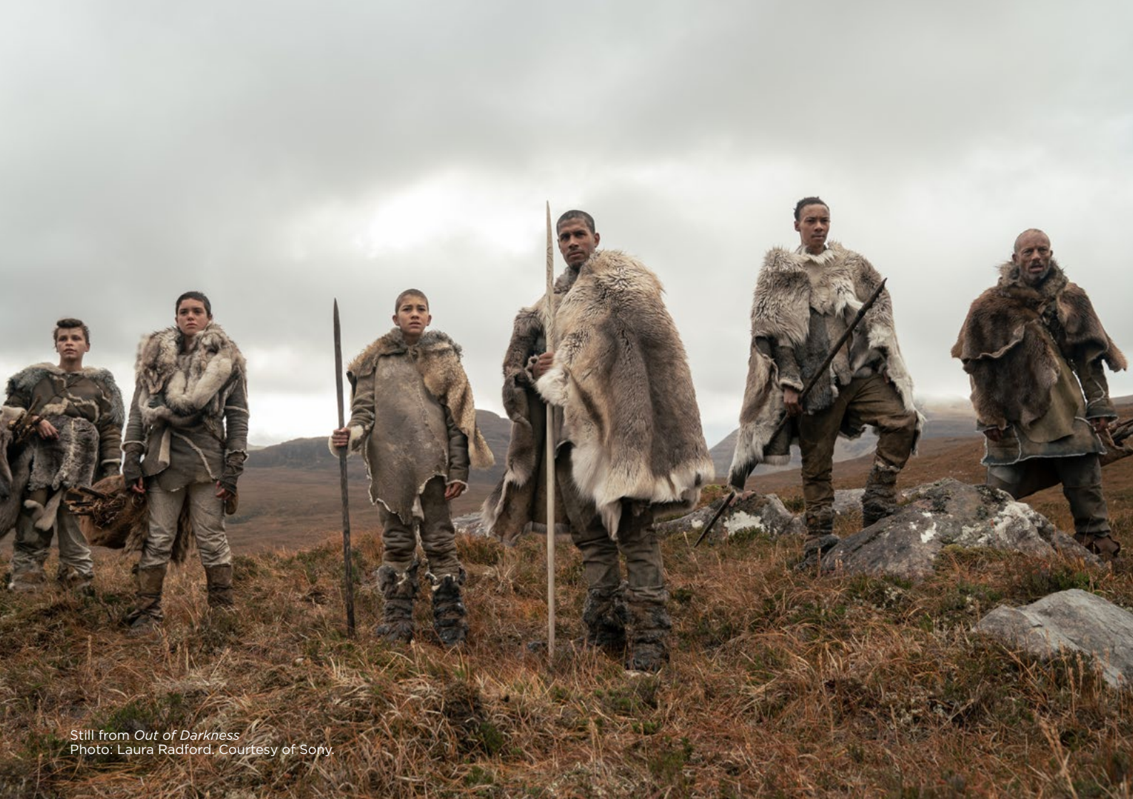
Still from Out of Darkness