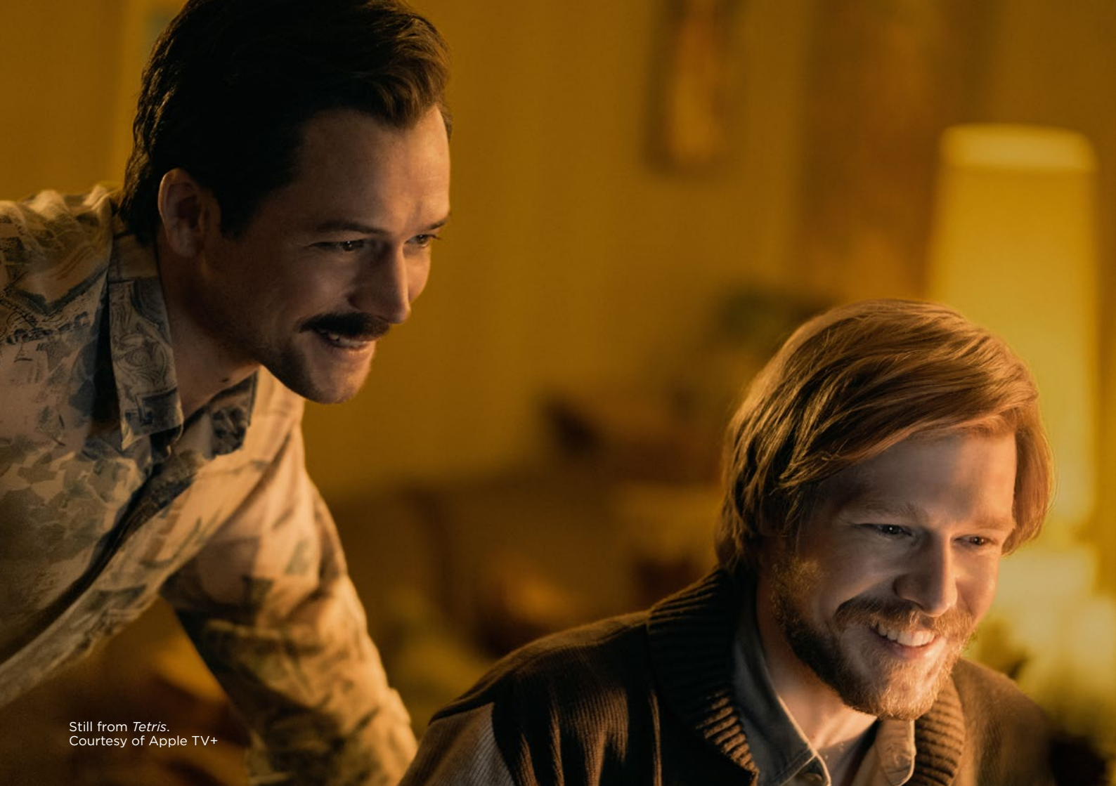
Still from Tetris . Courtesy of Apple TV+