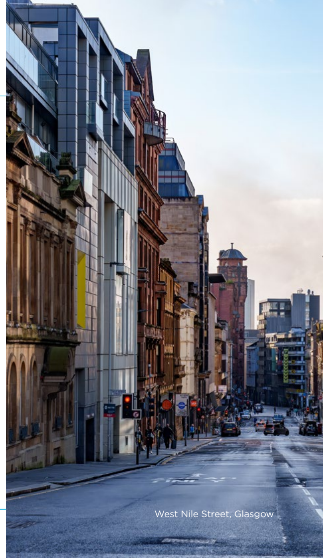
West Nile Street, Glasgow

E: locations@creativescotland.com screen.scot