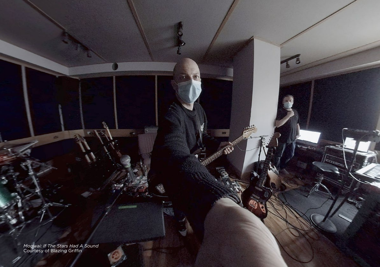
Mogwai: If The Stars Had A Sound