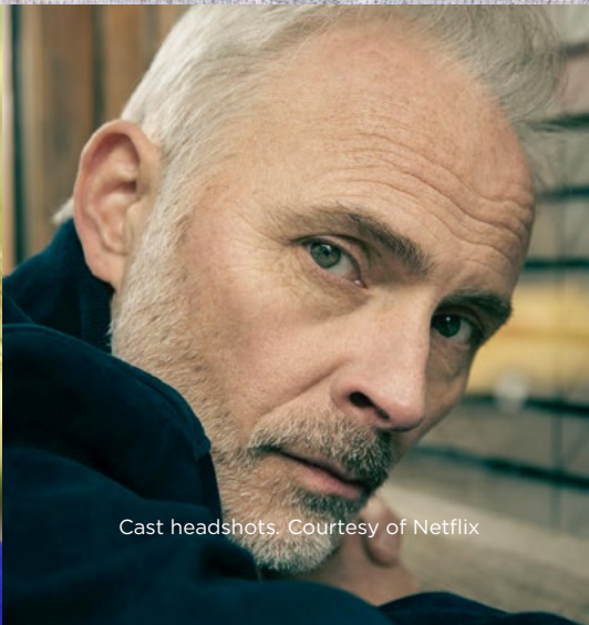
Cast headshots.